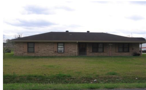
229 ISLE OF CUBA RD.