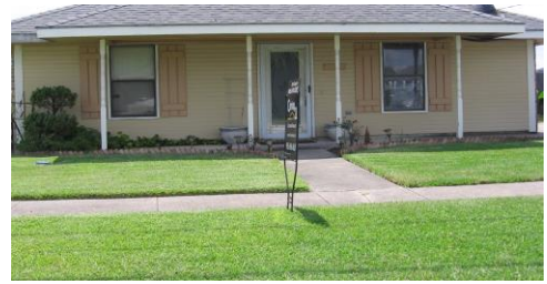
3013 SYCAMORE DR.