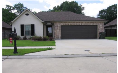
157 JULIANA WAY