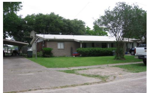
139 EVELYN AVE.