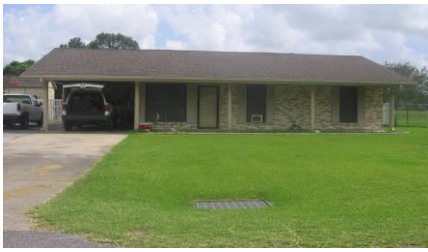
115 TINA ST.