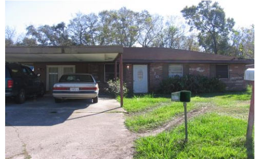
320 SAINT PATRICK ST.