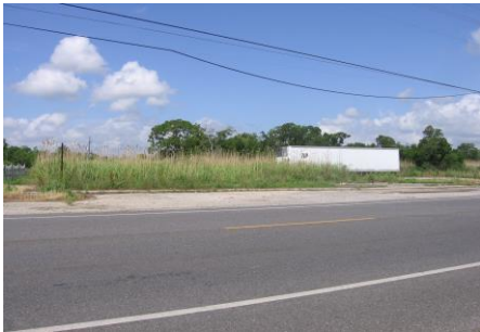
6066 GRAND CAILLOU RD.