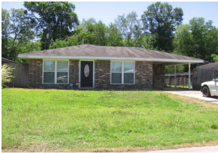
316 SAINT PATRICK ST.