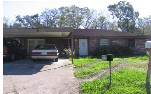
320 SAINT PATRICK ST.