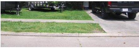
4 J CIRCLE