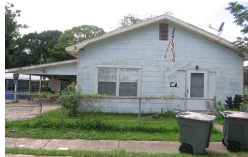
116 AUTHEMENT ST.