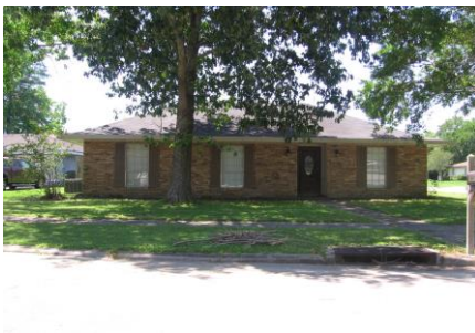
2807 BROADMOOR AVE.