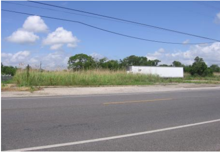
6066 GRAND CAILLOU RD.