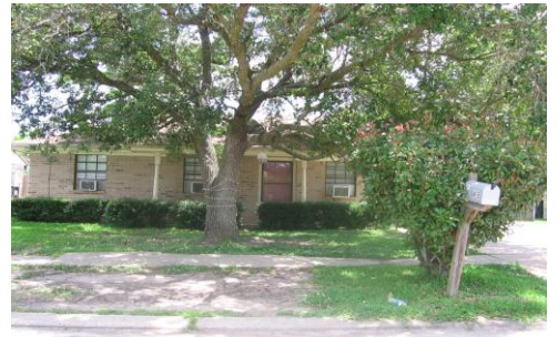
3711 BAKER DR.