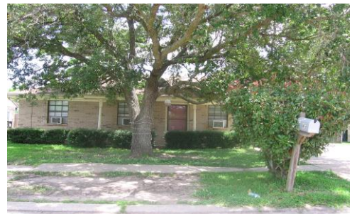
3711 BAKER DR.