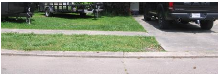
4 J CIRCLE