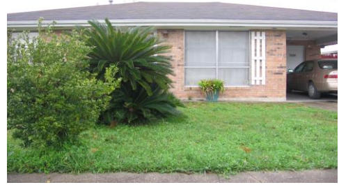
1405 KEITH ST.